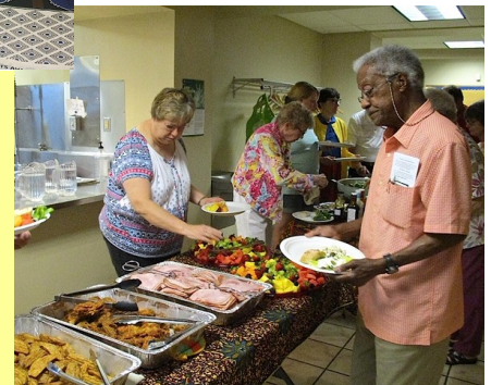
Enjoying the feast