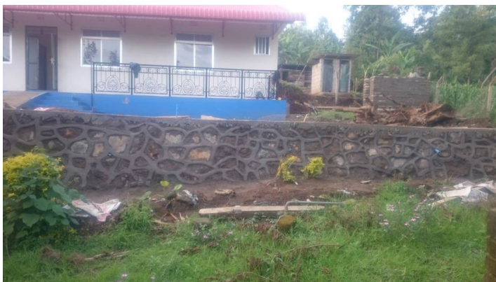
This recent picture shows the retaining wall between the two buildings and the partially built water tower on the right.