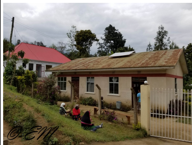
Original building with new solar panels installed and new building in the background.