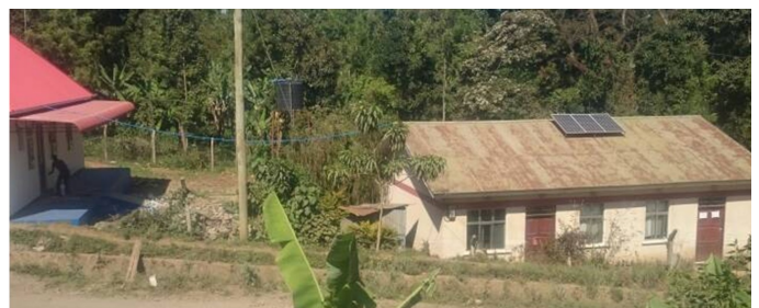
Solar panels installed on the current building and connected to the new building