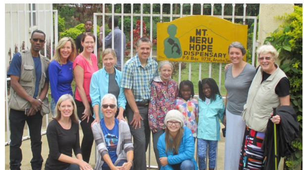
2017 Mission Trip Participants