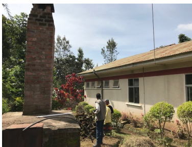
Below: Exaudh and Rosifina discuss what it will take to manage the combined property and buildings.

We also determined policies for payments in line with the other hospitals in the area. When a patient comes for the first time