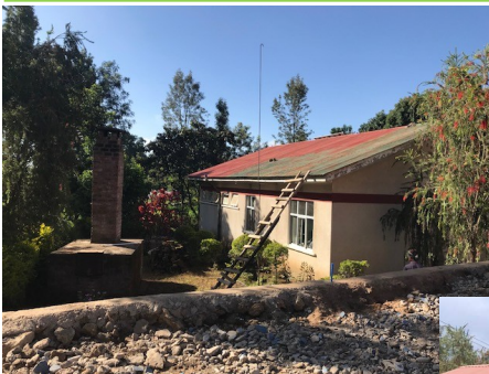
The roof on the original building was painted.