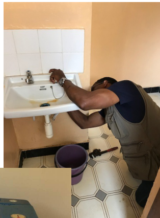
Right: Exaudh fixing faucets.