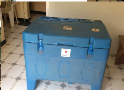
Left: immunization fridge.