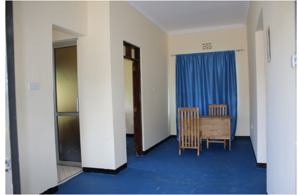
Reception area above and education room below.

The Ndoombo Community Dispensary is on it's way to serving more people with a wider variety of services. This would not have been possible without your support. Thank you to all our donors for your support and we look forward to our continued partnership together.