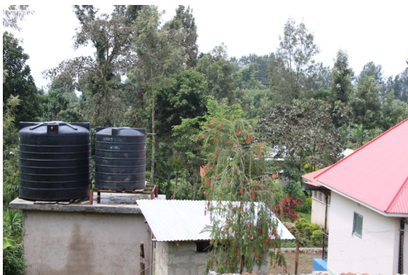
Water tower to the left. New building and campus to the right.