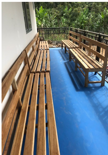
New furniture: benches and desks