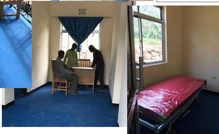
Below: maternity bed